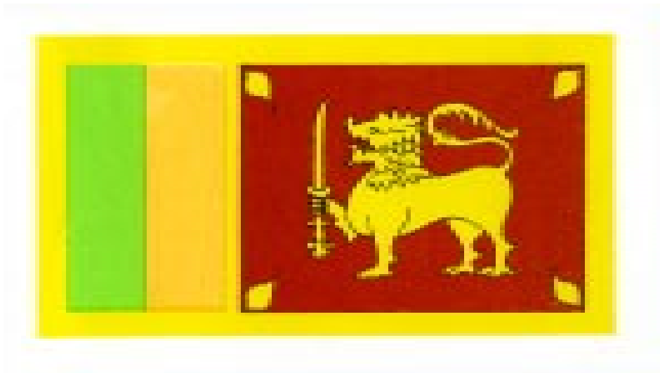
The National Flag